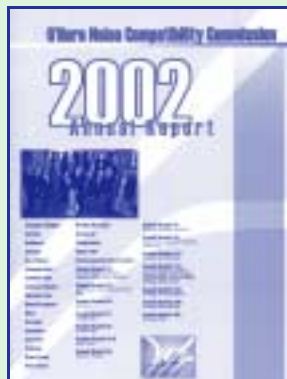
The 2002 Annual Report is available online at www.oharenoise.org

As explained in the Commission's 2002 Annual Report, 27 of the permanent noise monitors, showed a 1 dB or greater reduction in aircraft noise levels in 2002 as compared to 2000. The average among all the monitors was a